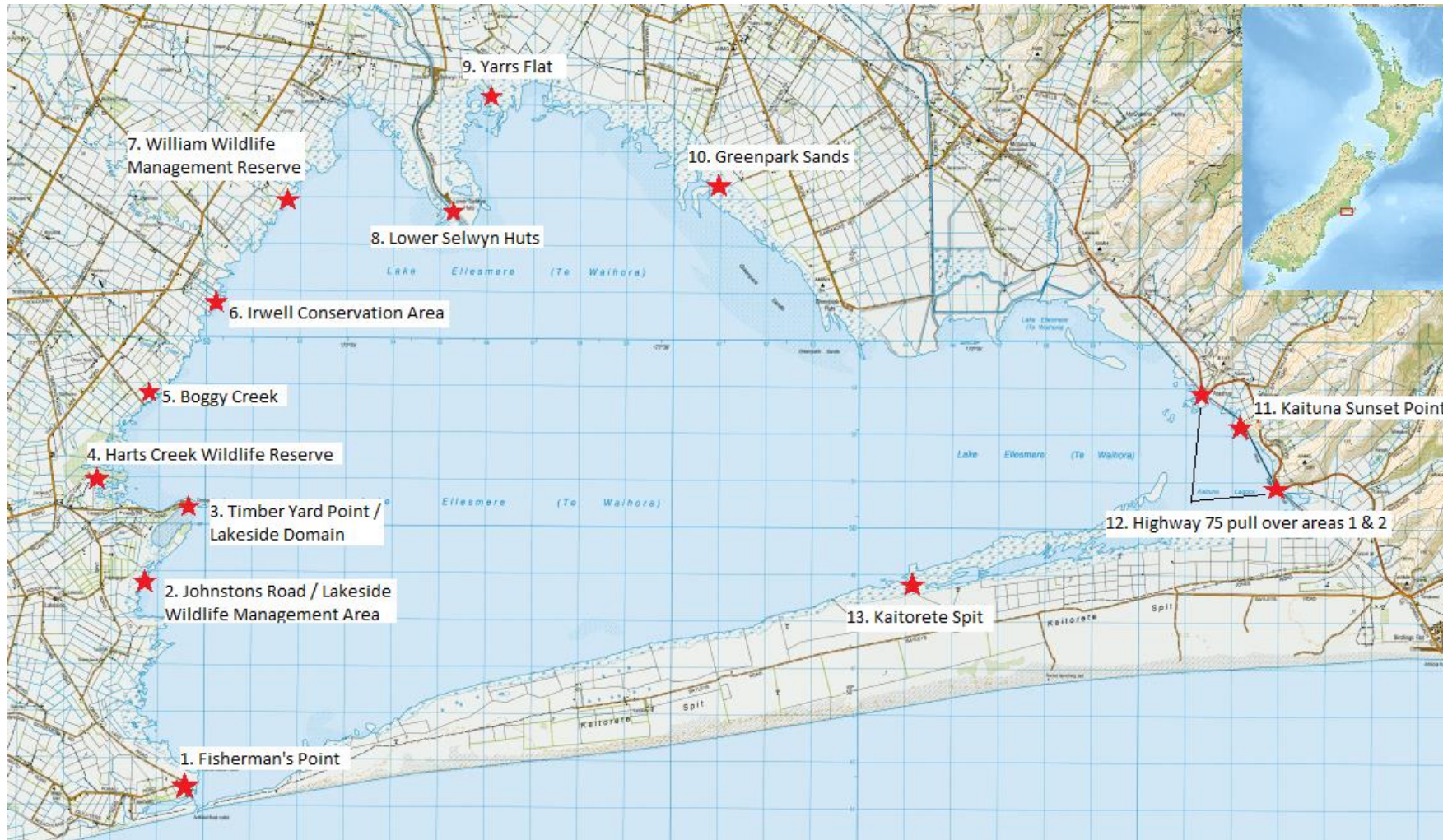
Figure 2 Map of Lake Ellesmere/Te Waihora with 13 key recreation sites indicated 3