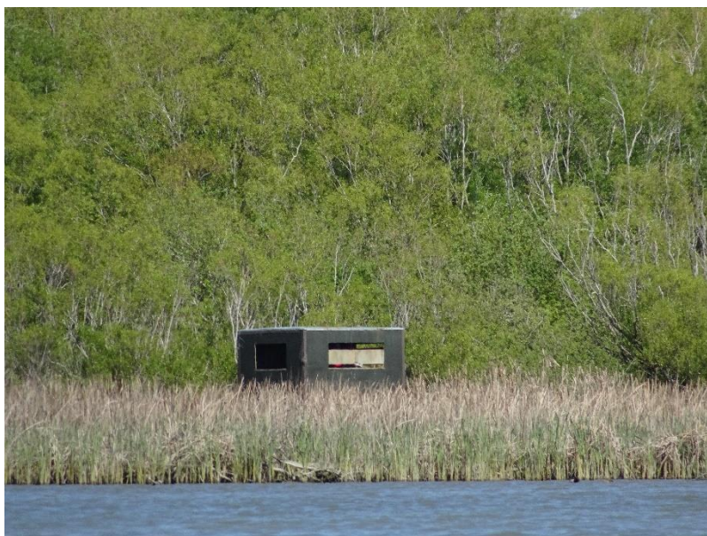
Figure 3 Harts Creek/Waitatari Bird Hide.

Self-registration is a simple method that can be used to collect visitor number data, along with additional data including visitor profile and trip information (Watson, Cole, Turner & Reynolds, 2000). For example visitors to the Harts Creek/Waitatari bird hide are currently invited to register their presence at the hide in a visitor's book. The method can be used to produce long-term data, as some types of registrations (such as hut books) have a long history (Cessford & Burns, 2008).