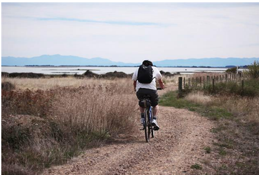
Figure 8 Cycling the Little River Rail Trail.

An example of calibration for the vehicle counters is onsite surveying of vehicles to determine the number of people in the vehicle, whether the purpose of the visit is for recreation and the incidence rate of the same vehicle re-entering the area multiple times within a given period. This surveying could occur at each vehicle counter site for a number of days staggered throughout a season/year, being sure to avoid known events etc. that may impact on the representativeness of that particular day. A student could be hired to undertake three days of calibration surveying at each of the four vehicle counter sites, for which a budget of approximately $2500 would need to be allocated to cover wages and basic operational costs.