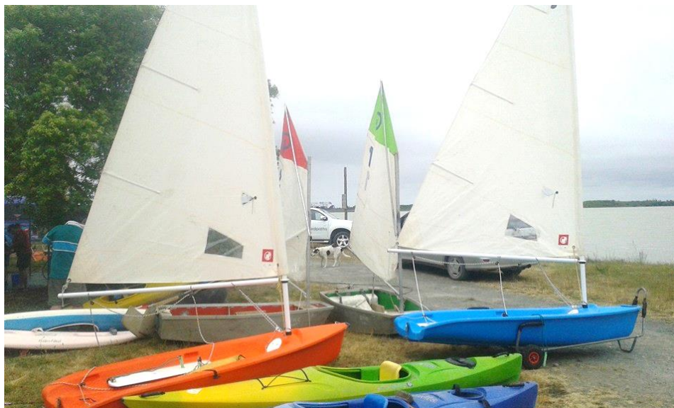
Figure 1 Sailing Boats at Lakeside Domain.

Since the 1880s Lake Ellesmere/Te Waihora has provided a wide range of outdoor recreation opportunities, and is identified as a potentially nationally significant water body for recreation (Ministry for the Environment, 2004). Recreational activities that are known to occur on the lake and its margins are: fishing (for trout, flounder/pātiki, eel/tuna, whitebait/inanga), gamebird hunting, water sports (swimming, kayaking, sailing, power-boating, windsurfing), walking, cycling, bird watching, photography, camping, picnicking (Hughey, 2013), geocaching, 4-wheel driving, educational activities (Espiner et al., 2017), and volunteerism (Booth, 2009).