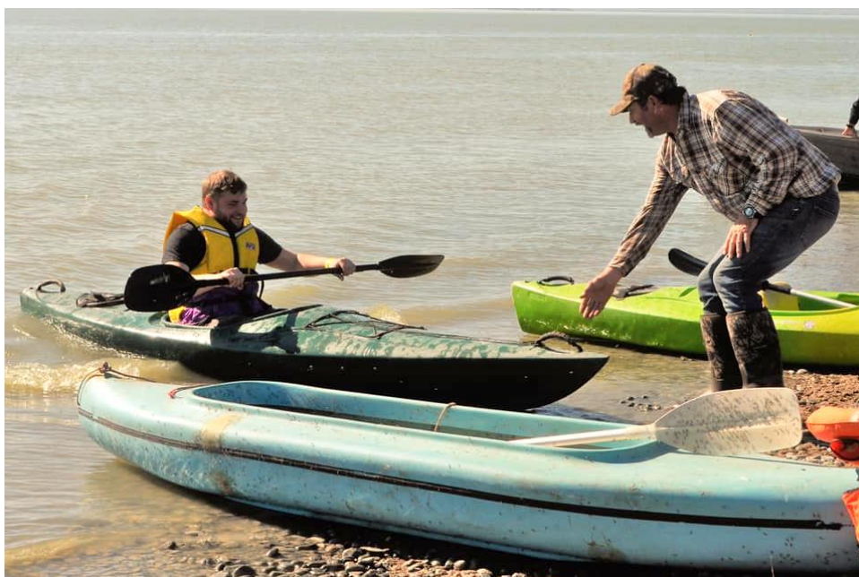
Figure 5 Kayaking at Lakeside Domain.

Vrana (1999), as part of a manual that provides guidelines and a review of protected area monitoring (see Hornback & Eagles, 1999), describes that methods such as visitor entry permits, on-site surveys and aerial surveys of visitor activity have been used with varying degrees of success in monitoring visitor use of marine and coastal protected areas. While all have been used successfully for visitor monitoring in some marine and coastal protected areas, the author identifies some limitations of these methods for monitoring in “open” areas. Visitor entry permits are reliant on the need for a permitting system to be in place, which many marine and coastal areas do not have. On-site surveys require trained personnel to administer the surveys and put a burden on the visitors, while it can be challenging to collect a representative sample of visitors given the dispersed nature of the environment. Aerial surveys were used to observe the number of vessels in marine areas, however such surveys are dependent upon the ability of survey personnel to distinguish the different types of activity.