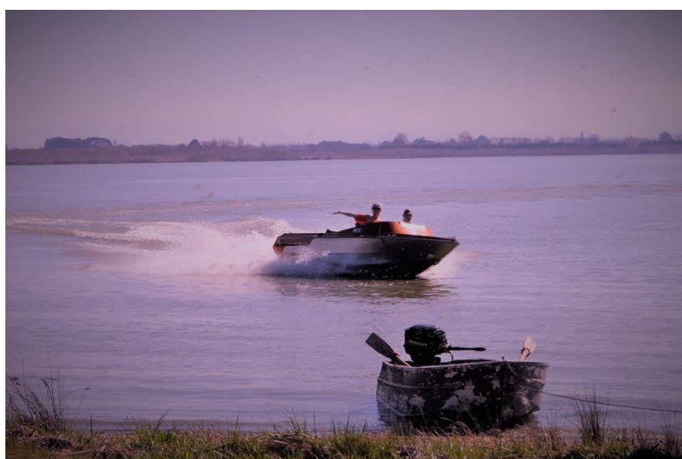
Figure 6 Boating at Lakeside Domain.