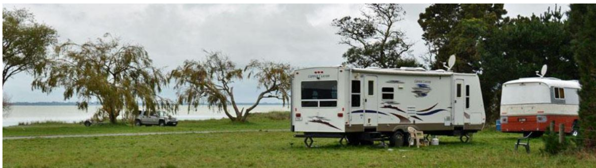
Figure 4 Motorhomes at Lakeside Domain.

Other types of mobile applications are used to collect 'citizen science' data, whereby members of the public upload observations to the database. eBird 6 is one example of a citizen science based application, where members contribute by collecting data on the distribution and abundance of birds through uploading sightings to the database (Sullivan et al., 2014). Given that location is logged as part of the bird sighting, such data could be used as a monitoring indicator for birdwatching in the area.